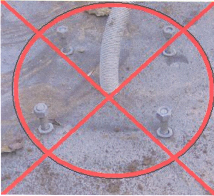
Fig 2 Incorrect Conduit Position